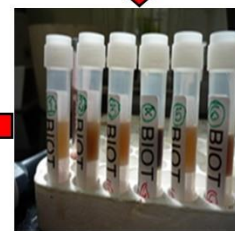
Gastric content analysis

ARTICLE HISTORY Received 29.03.2018 Accepted 14.04.2018