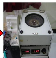
Gastric content centrifuged