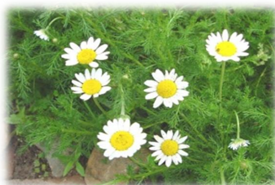
Figure 1. Matricaria chamomilla

Hippocrates described chamomile as a medicinal plant and chamomile tea was recommended by Galen and Asclepiades [5] . During the same period, Mathiolus/ Peter Ondej Mathioli described chamomile in his Latin herbarium [6] , where he listed the essential oil of chamomile as a remedy against spasms [5] . In Unani medicine it flowers is called Gul-e-Babuna [7] .